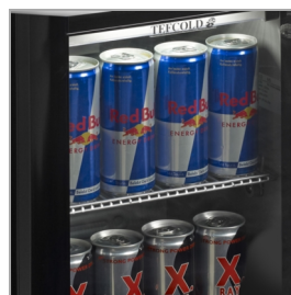
Designed for Energy-cans