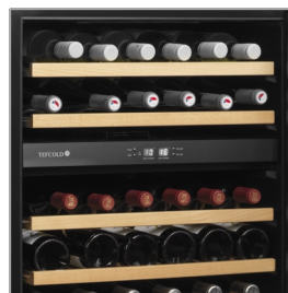
Wooden drawing shelves