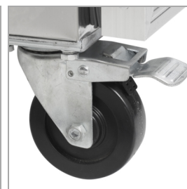
Strong wheels as option